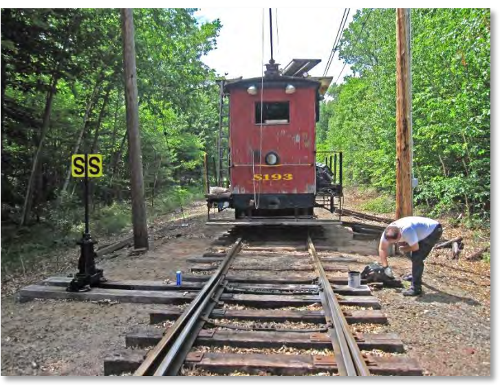
Roger Pierson painting at the West end of Hancock Siding.

suited for storage of streetcars and smaller rolling stock. With the idea of making Northern Barn an operational area (overhead wire still to be installed), the decision was made to upgrade the entire second track of the barn. This huge