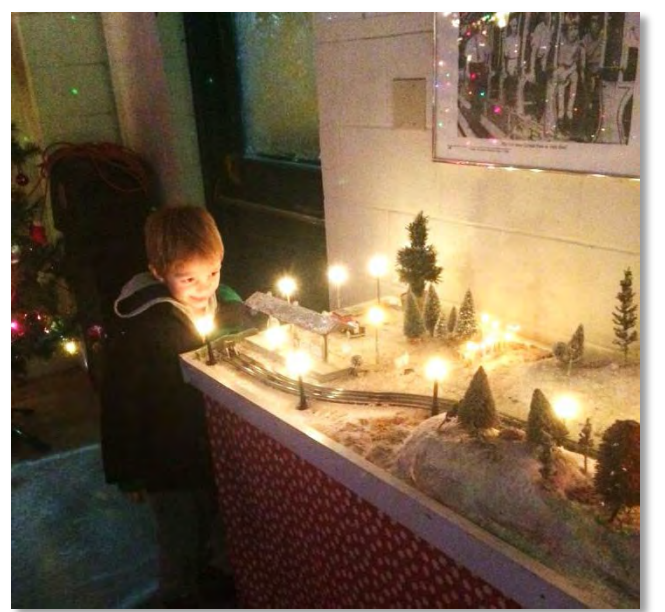
Winner of the 2015 Winterfest Photo Contest.