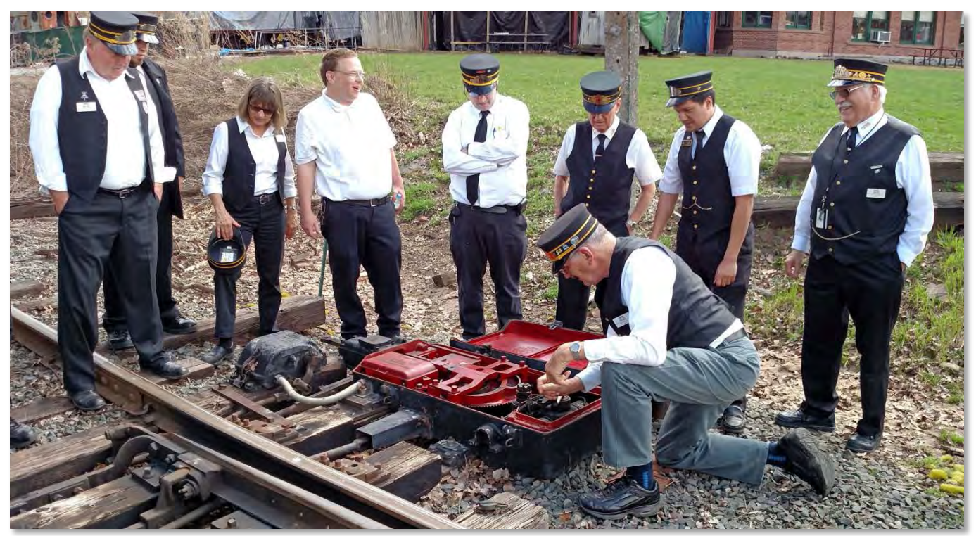
Reviewing the manual operation of the switch at North Road Station during Requalification Day 4/18/15.