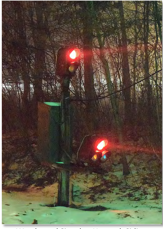
Westbound Signal at Hancock Siding.

organized accessible resource. The Wednesday work sessions occurred through the spring and summer and up to the point that special events take over the focus. We are planning to start up