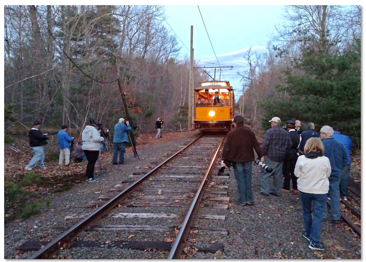
Xian Clere at the controls of No. 355 Westbound on April 25<sup>th</sup> during our first night time photo shoot.

Needless to say, it was a very busy year and as always, THANK YOU to everyone who made our 75th year the success it was!